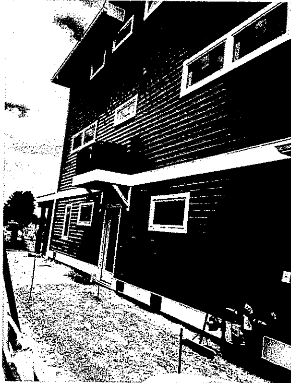
LEFT SIDE VIEW FROM FRONT